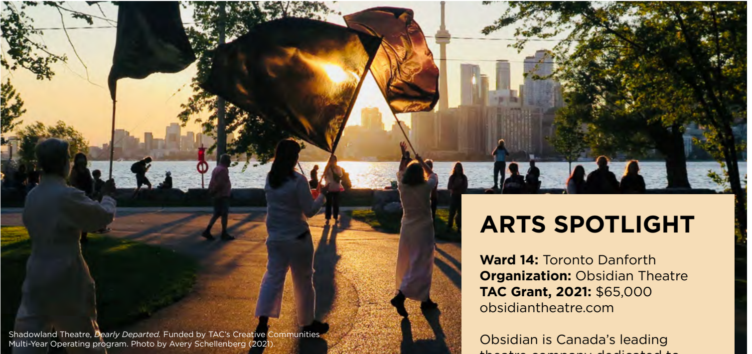
Shadowland Theatre, Dearly Departed . Funded by TAC's Creative Communities Multi-Year Operating program. Photo by Avery Schellenberg (2021).