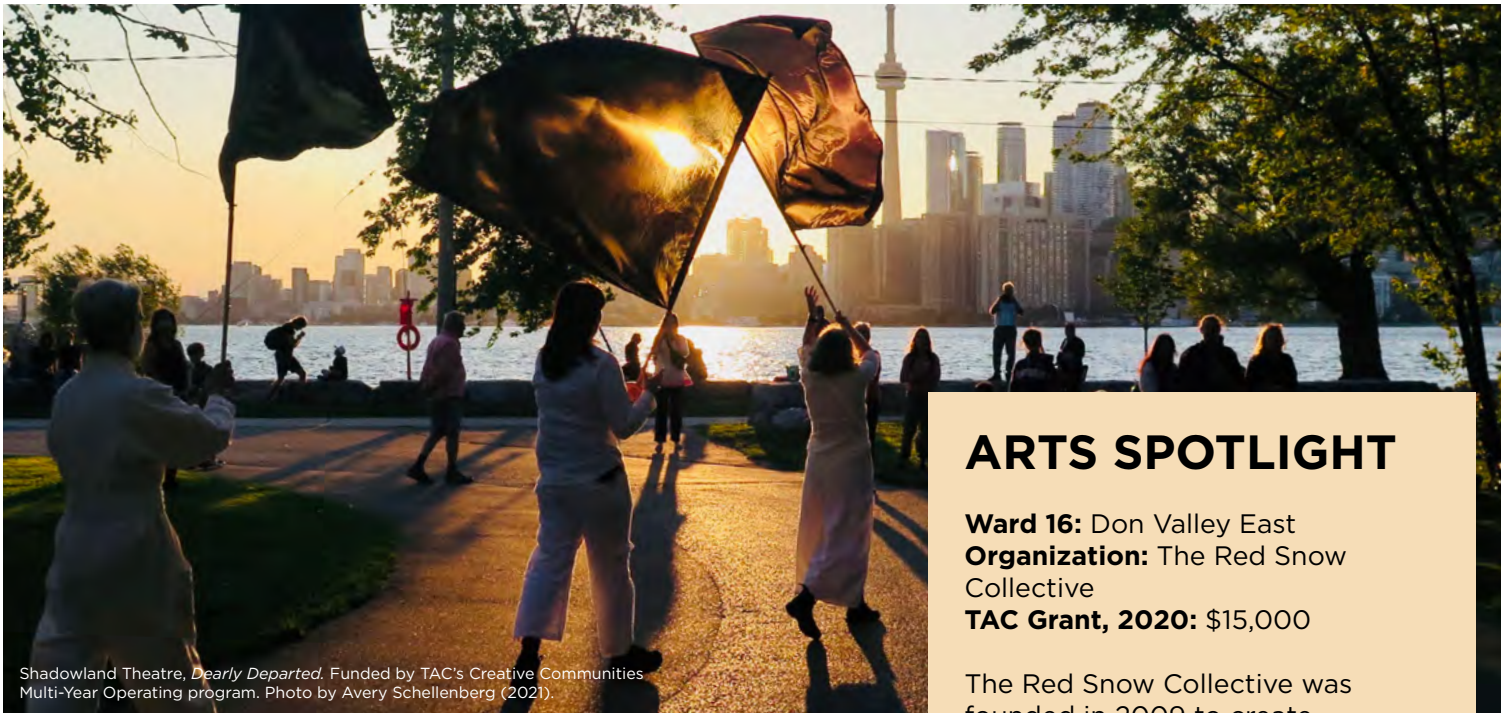
Shadowland Theatre, Dearly Departed . Funded by TAC's Creative Communities Multi-Year Operating program.