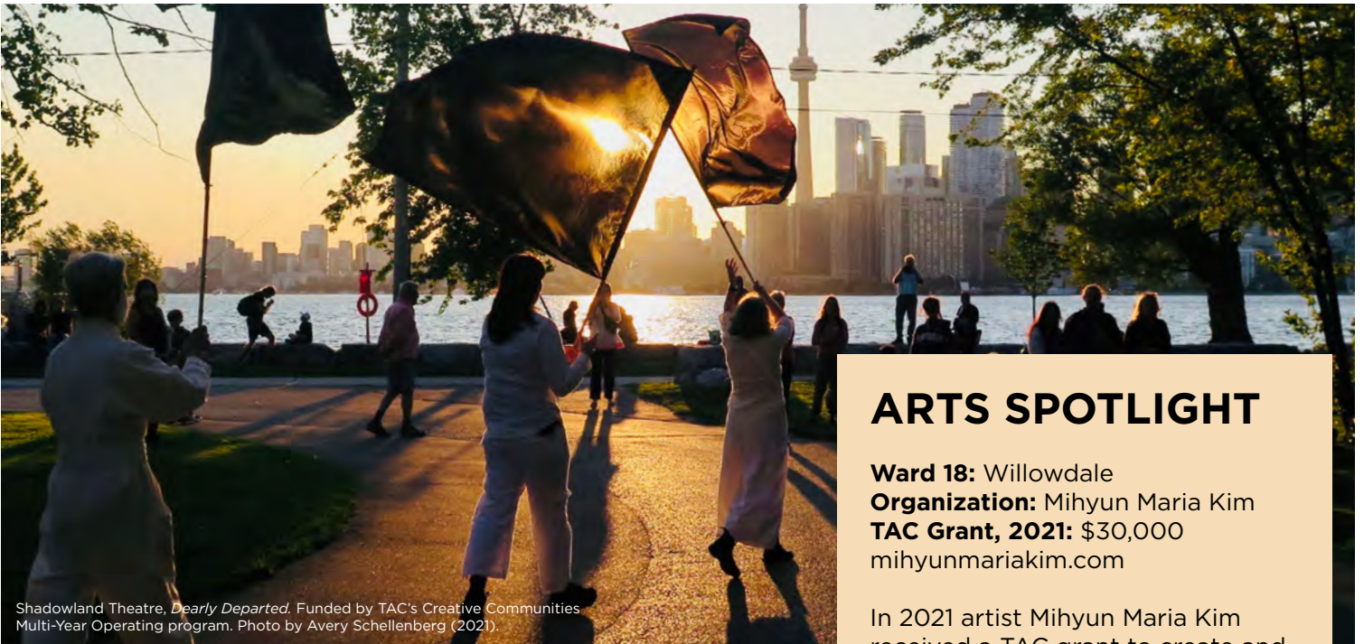
Shadowland Theatre, Dearly Departed . Funded by TAC's Creative Communities Multi-Year Operating program. Photo by Avery Schellenberg (2021).