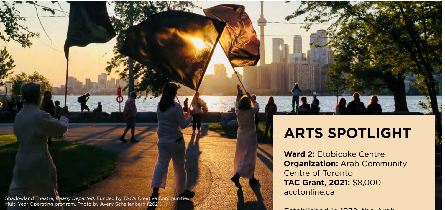
Shadowland Theatre, Dearly Departed . Funded by TAC's Creative Communities Multi-Year Operating program. Photo by Avery Schellenberg (2021).