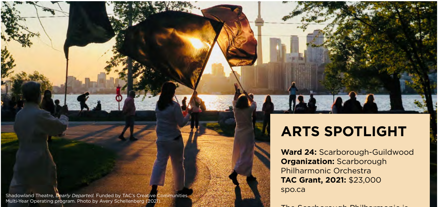
Shadowland Theatre, Dearly Departed . Funded by TAC's Creative Communities Multi-Year Operating program. Photo by Avery Schellenberg (2021).