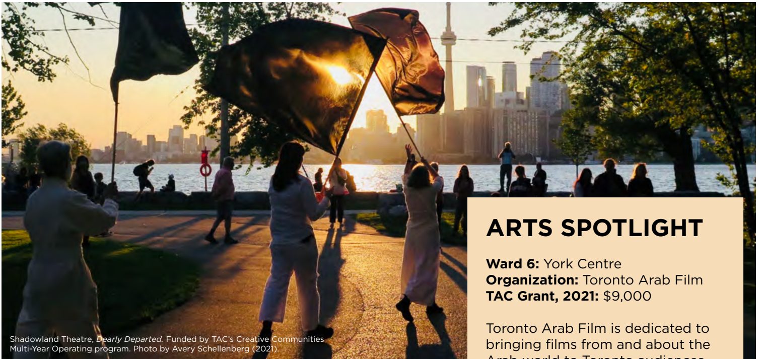
Shadowland Theatre, Dearly Departed . Funded by TAC's Creative Communities Multi-Year Operating program.