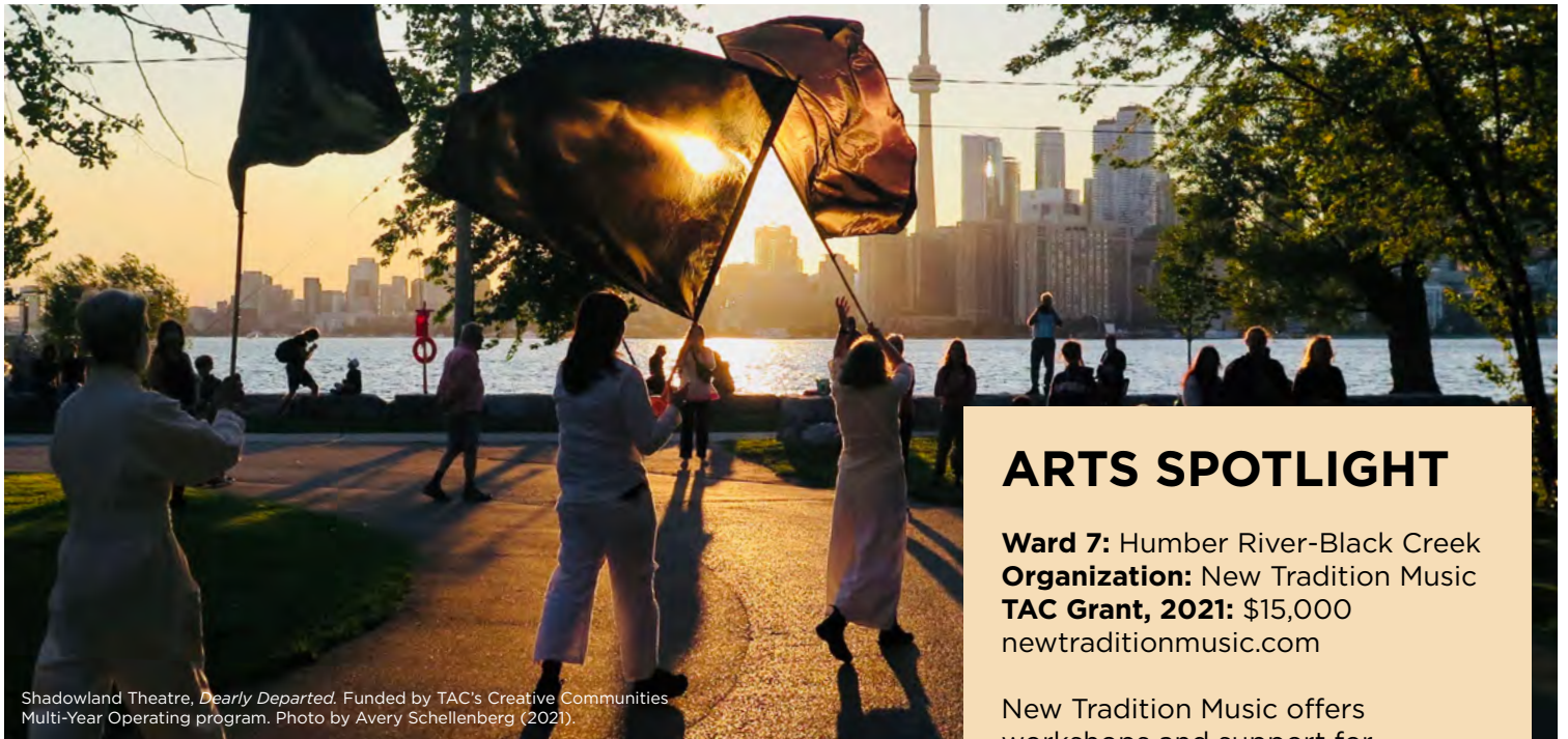
Shadowland Theatre, Dearly Departed . Funded by TAC's Creative Communities Multi-Year Operating program.