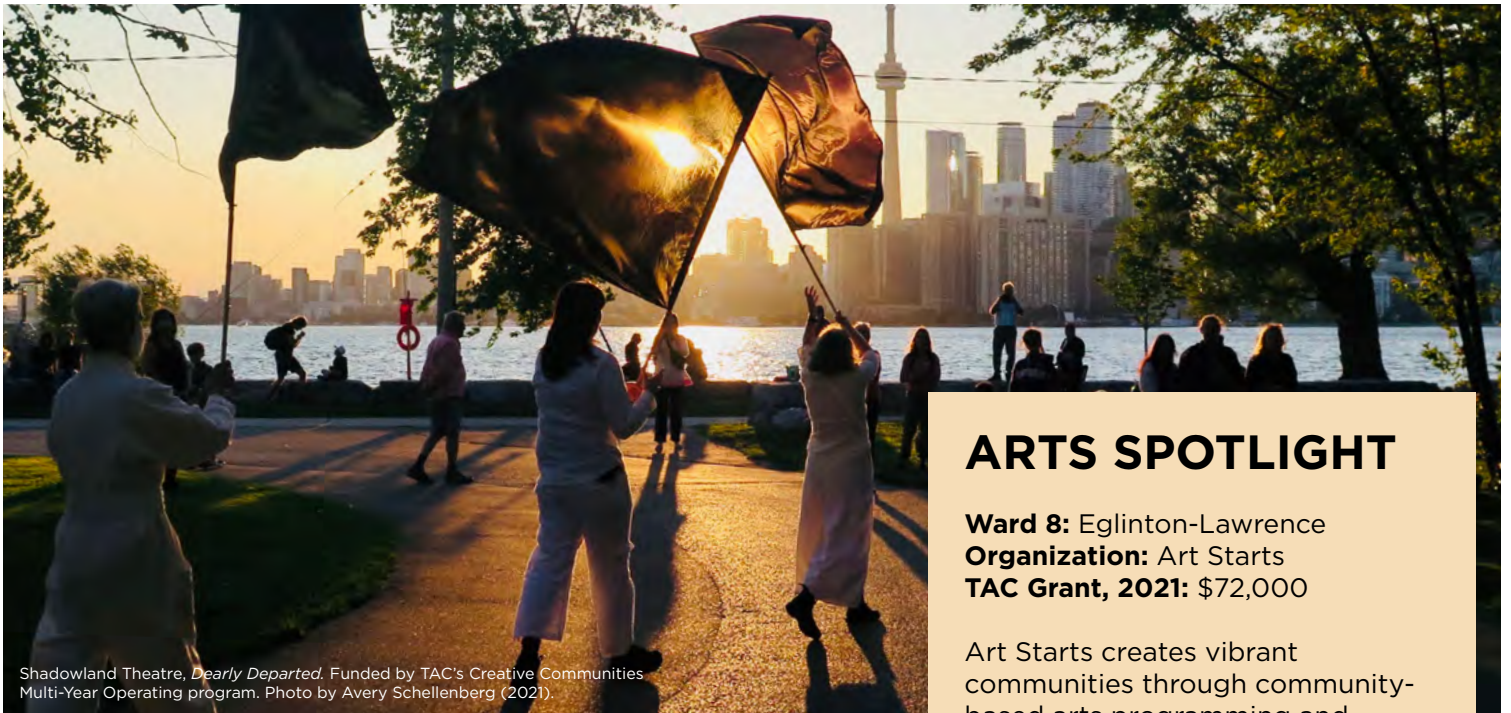
Shadowland Theatre, Dearly Departed . Funded by TAC's Creative Communities Multi-Year Operating program.