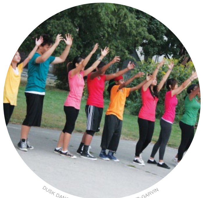
DUSK DANCES

However we recognize that context and identity, or where someone is coming from, can be useful in helping readers to understand a quote or perspective; therefore, we have included basic roles alongside quotes such as: visual artist, community health worker, youth support worker, arts administrator, youth leader, educator, etc.