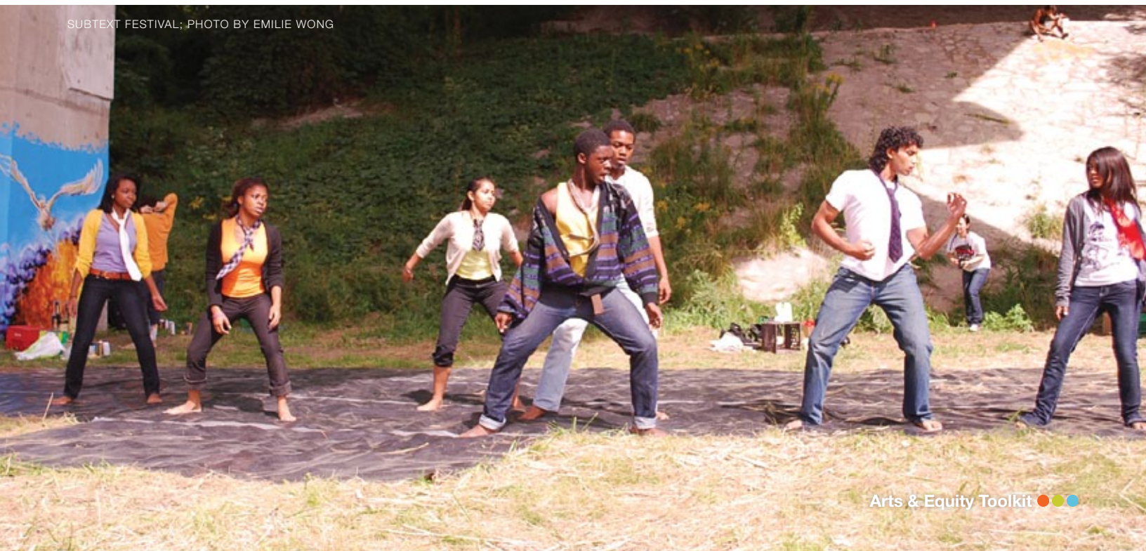
SUBTEXT FESTIVAL

It is also important to recognize that while we bring ourselves (skills, knowledge, sense of self) to a community we also further develop ourselves as we engage with community. Reciprocity is an integral component of equitable community-engagement. Reciprocity means that there is a back-and-forth sharing of resources and an ethic of mutual respect. Everyone involved both gives and receives something; it could be knowledge, materials, ideas, time, energy, space, or other contributions. In equitable community-en-