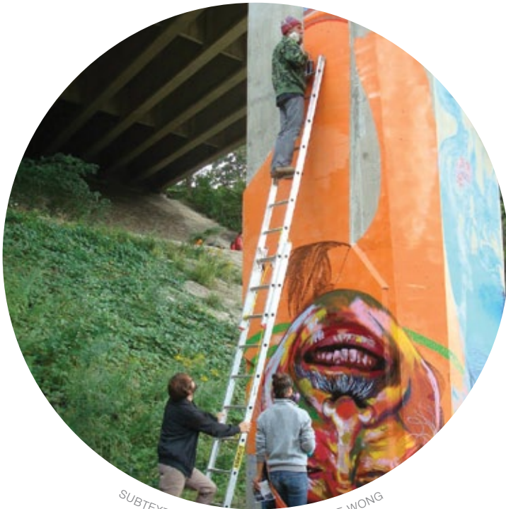
SUBTEXT FESTIVAL

Lead Partners: Scarborough Arts, Mural Routes, East Scarborough Storefront, Toronto Regional Conservation Authority, Jumblies Theatre, City of Toronto Cultural Services, The Amazing Place, and Live Green Toronto