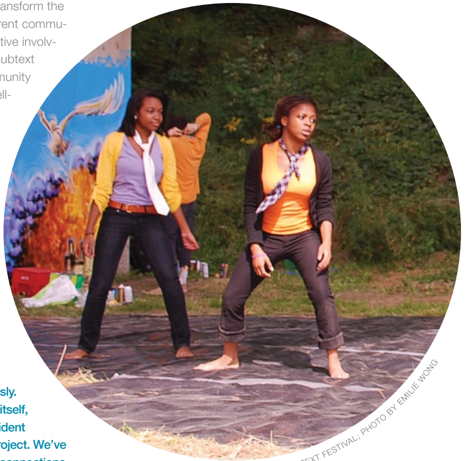
SUBTEXT FESTIVAL; PHOTO BY EMILIE WONG

“Groups helicoptering into Kingston-Galloway/Orton Park is an ongoing issue and an ongoing challenge....we’re working to strike a balance between sustainability and accountability.”