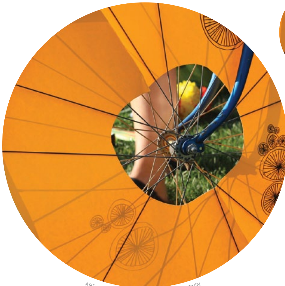
ART SPIN

Tips for first-time organizers of an advisory group. https://www.thebalancesmb.com/your-first-advisory-board-meeting-2947125